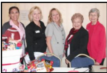
St. Petersburg members attend the Gulf Coast Council Spring Education Conference